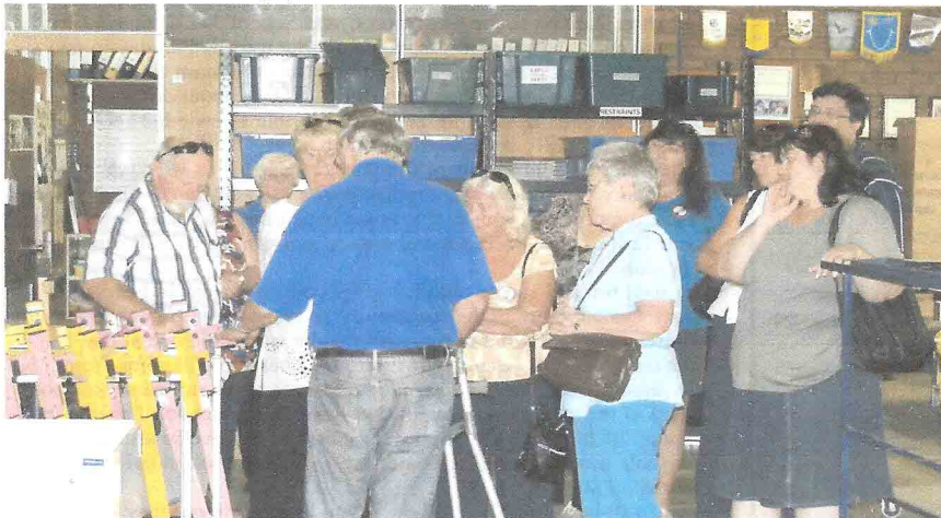
Ballajura Lions Wheelchairs for Kids visit shows members listening intently to the explanation of how chairs are made.

Official Publication of the Lions in District 201W1